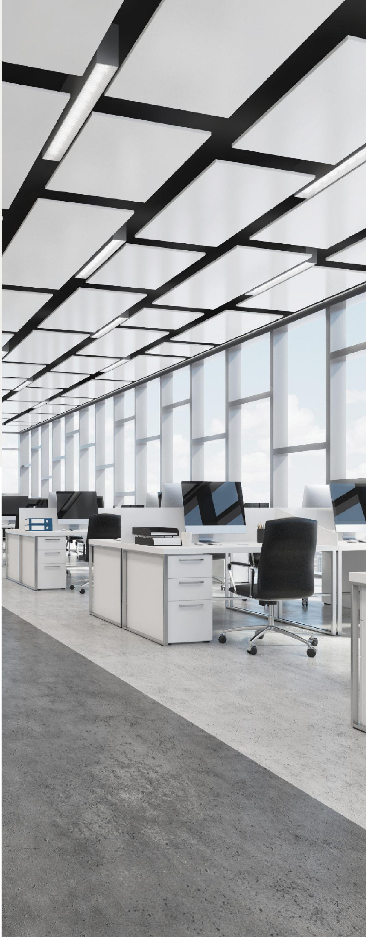
Sample Floor Plate