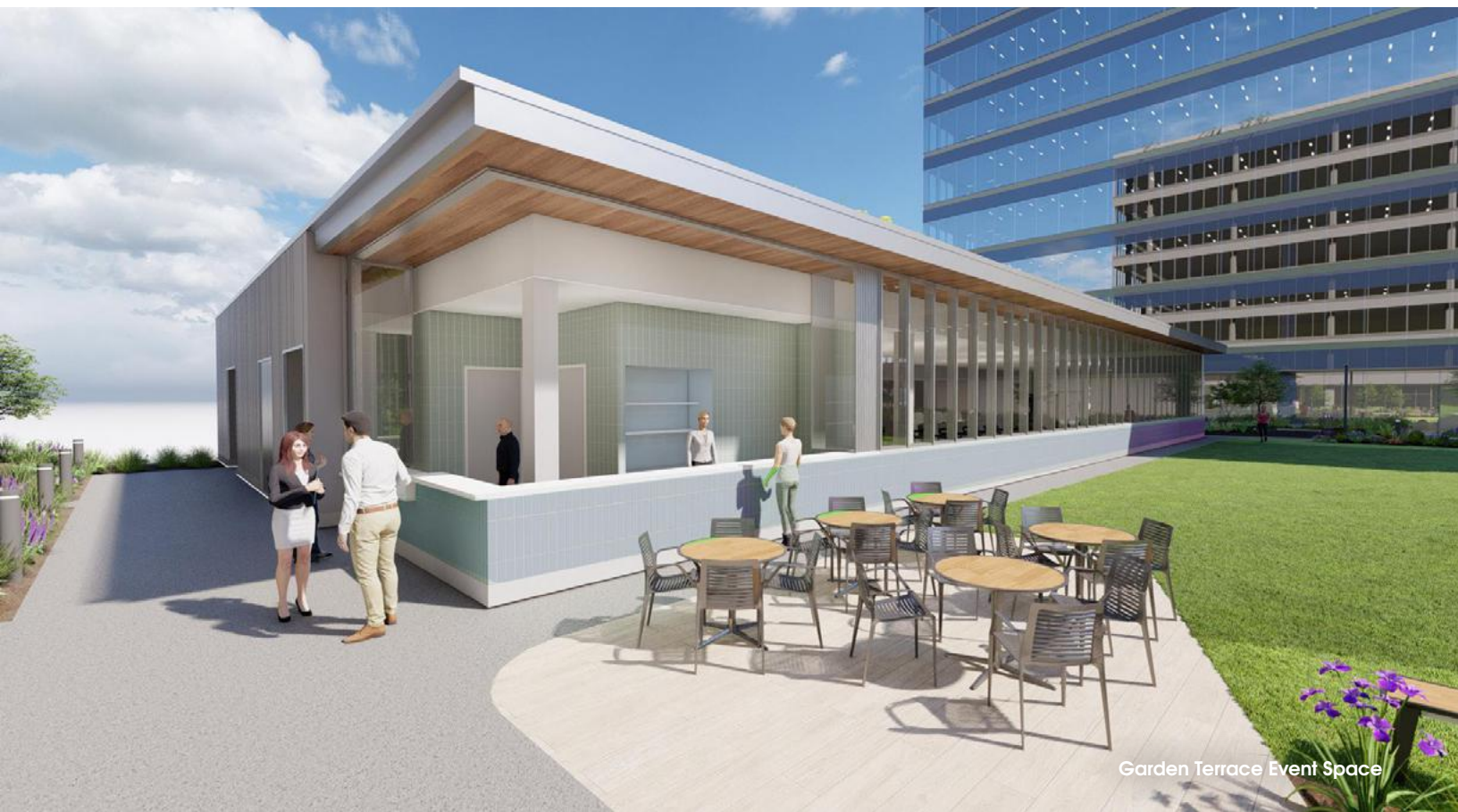
Garden Terrace Event Space