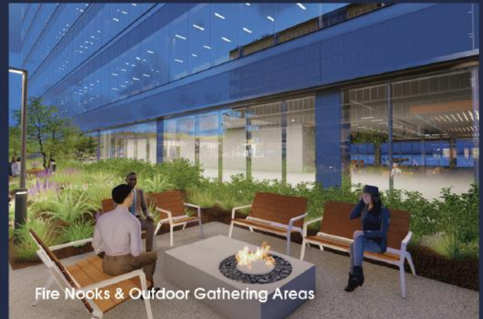
Fire Nooks & Outdoor Gathering Areas